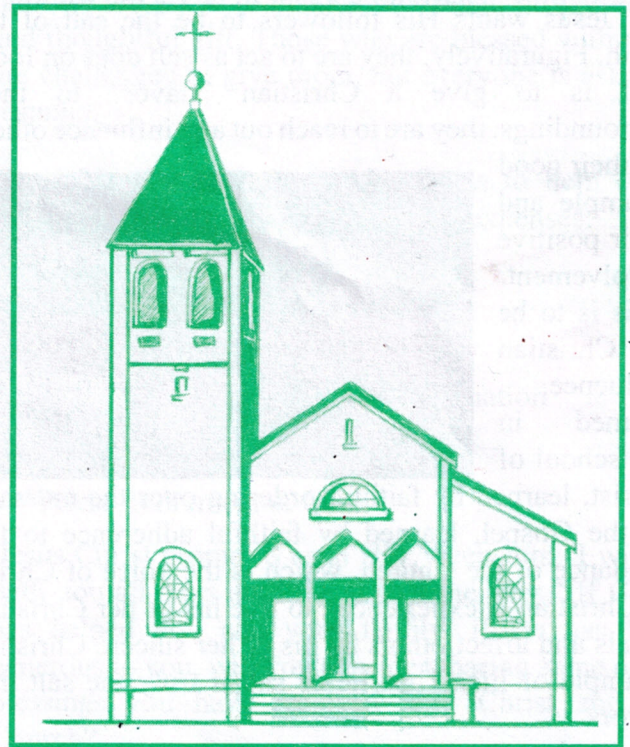
St. Patrick Mission, Port Costa

WELCOME! Our warmest welcome to all who celebrate with us, whether longtime resident or newly arrived in the parish. We thank God for you! If you are not on our parish list—please fill out the form below and place in the collection basket or mail to the office.